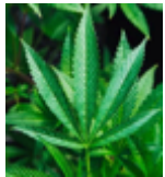
Plant test sample

NOTE: samples can be heated in a thermal cycler, heating block, oven, or hot water